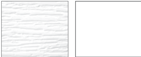
Woodgrain embossed texture and smooth surfaces available for trimboard

Royal Precision Cut Trimboard is easy to install and exactly what its name indicates: an exterior accent that gives any home a meticulous, standout presence. Plus its wide range of styles and sizes complement virtually every type of siding.