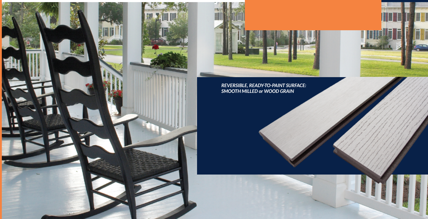
REVERSIBLE, READY-TO-PAINT SURFACE: SMOOTH MILLED or WOOD GRAIN