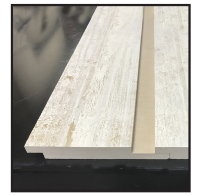
Custom Channel Siding Private Residence Princeton, NJ