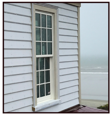
Custom Siding, Casing, and Sills Private Residence Kiawah Island, SC

DURATION® is the industry leader in poly-ash composite moulding and custom millwork production and produces all material from TruExterior<sup>®</sup> Trim and Siding Products.